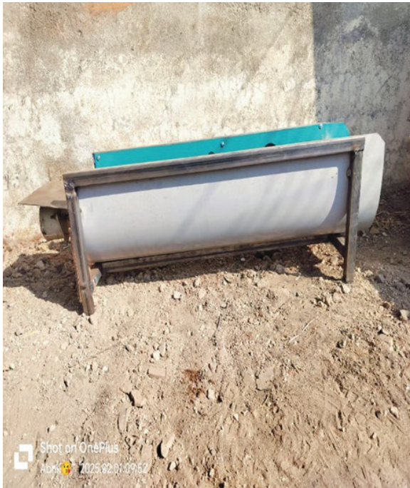
Fig. 2. Experimental Setup.